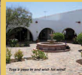
Toss a peso in and wish for wind!